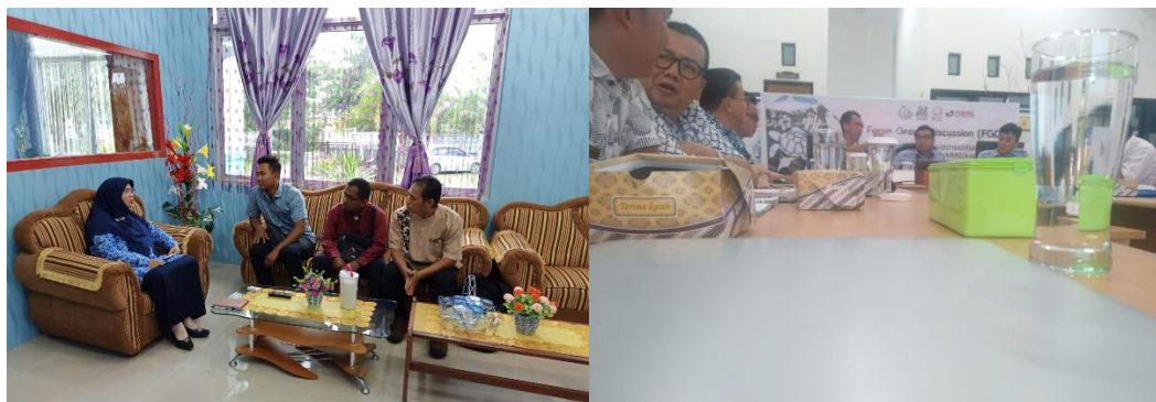
Figure 6. Meetings and Forum Discussion with Stakeholders.

The stakeholder's analysis was started in June 2019. The project staff discussed the potential stakeholders throughout the 3 years' project implementation and connected them based on their roles and responsibility. 17 stakeholders were identified, and they will be engaged relevant to the project activities during the project implementation. Please see Appendix 5 for the full list of stakeholders. We will ensure the relevant stakeholders are involved in the projects approach, to strengthen cooperation between marine stakeholders. The strategy for stakeholder engagement consists of; preliminary visits / initial meetings, regular meetings, involvement in marine partnerships forum and taskforces. Stakeholder meetings are shown in Figure 6.