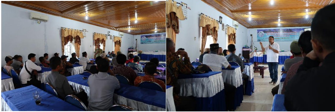
Figure 8. Initial Discussion for Establishment of LMMAs (Lhok) networks in Simeulue

2a. Give details of any notable problems or unexpected developments/lessons learnt that the project has encountered over the last 6 months. Explain what impact these could have on the project and whether the changes will affect the budget and timetable of project activities.