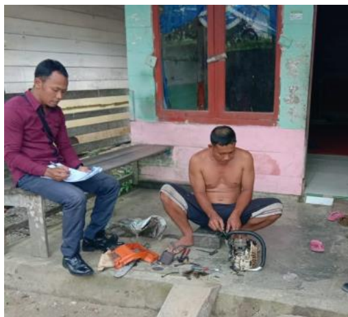
Figure 1. KAP Survey