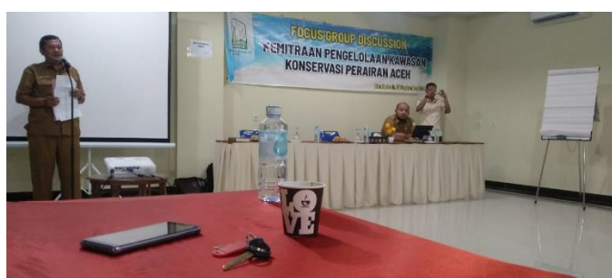
Figure 7. Focus Group Discussion of Conservation Partnership

On August 26, 2019 the Marine and Fisheries Agency launched a series of Focus Group Discussions (FGD) for the establishment of a MPA conservation partnership in Aceh. This activity aims to map the relevant stakeholders and partners to support the Technical Unit of Marine Protected Areas Management Body that is to be established in November 2019. To execute this at district level, the marine and fisheries agency representative will conduct field visits to several locations in order to build the MPA & LMMA networks. For Simeulue, FFI will facilitate dialogue between LMMA representatives (Panglima Laot) in and the Marine and Fisheries Agency on 4 – 8 November 2019. A FGD is shown in Figure 7.