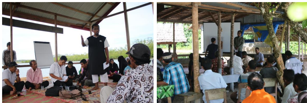
Figure 2 Socialization LMMA concept and formation of LMMA management committee headed of Panglima Laot.

The LMMA concept has been socialised to the fisher's communities and LMMA management committees have been established in the five target villages, headed by Panglima Laot. Details of committee structure are provided in Appendix 2 . All committees agreed to cooperate in forming LMMAs based on a participatory planning process, in order to develop management planning of lhoks (traditional fishing areas) and customary law consensus. LMMA socialisations and committee meetings are shown in Figure 2 .