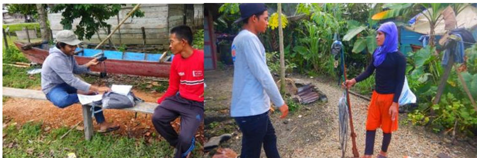
Figure 4. Preliminary PMSD survey in 5 villages.

control, market access and enabling environment in the five target villages. The surveys were implemented between September 30 and October 13, 2019. The data analysis is currently underway. PMSD initial surveys are shown in Figure 4.